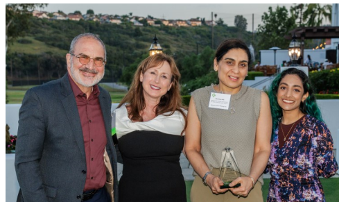
National Initiative Impact Award Winner Runner Up St. Luke's University Health Network