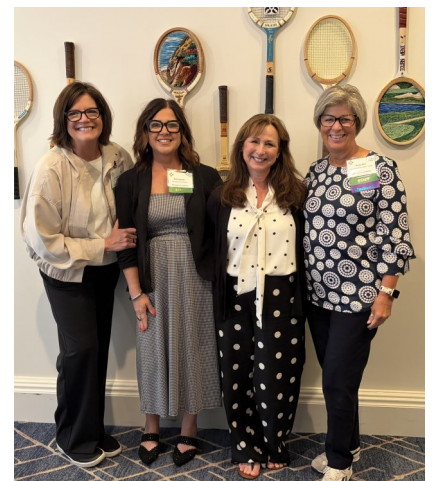
AIAMC Meeting Staff