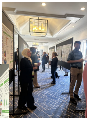
30+ Posters on Display