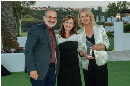
2026 AIAMC National Initiative Impact Award Winner Kaiser Permanente Northern California