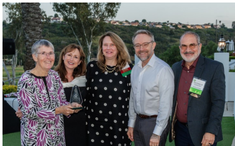
NI Impact Award Winner Runner Up Aurora Health Care|Atrium Health Care|Now part of Advocate Health

The AIAMC Annual Meeting was held April 16th—18th at the beautiful Omni La Costa Resort and Spa. Our Awards Dinner was held outside on property and brought gorgeous views, meaningful recognitions, and amazing networking. See page two for more photos of the conference!