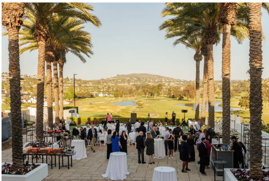
The stunning Valley Promenade at the Omni La Costa Resort & Spa, site of our awards dinner.