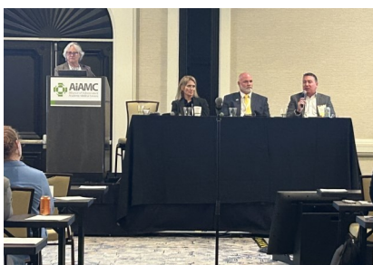
Advocacy in Action Panel