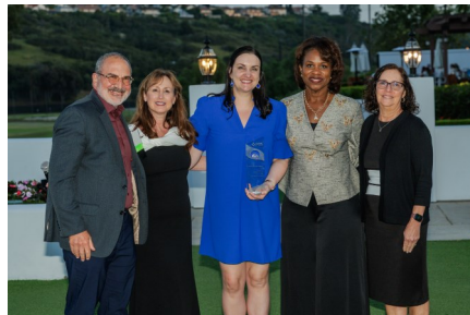
2026 AIAMC Innovation Award Winner JPS Health Network